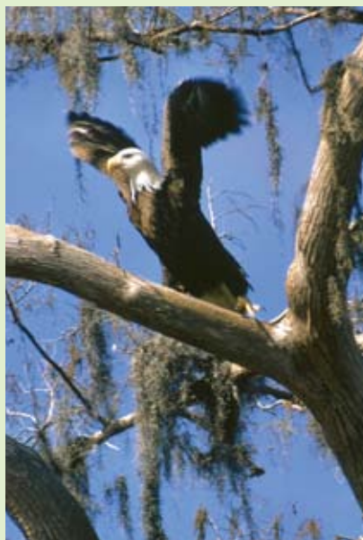
WILLIAM J. WEBER

The plan proposes adoption of a new rule to protect bald eagles and incorporates U.S. Fish and Wildlife