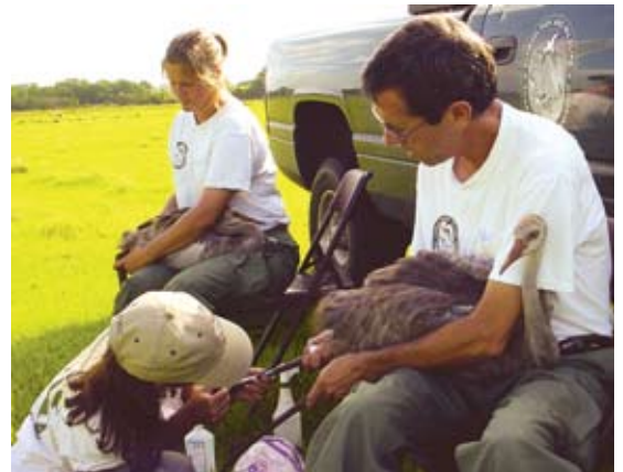
Health check of young sandhill cranes by Marty Folk