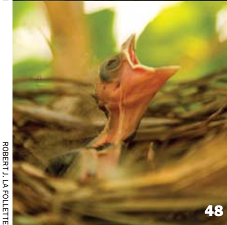
ROBERT J. LA FOLLETTE