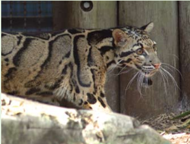
A rare clouded leopard walks around its enclosure at the Lowry Park Zoo.

Financial requirements have increased for exhibiting venomous reptiles and Class I captive wildlife. The bond for exhibiting venomous reptiles increased from $1,000 to $10,000.