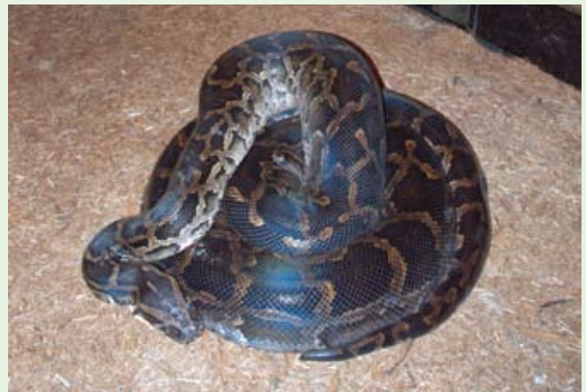
Burmese pythons are now listed as Reptiles of Concern and must be permanently identified by a microchip.

It is illegal to release any nonnative species into the wild in Florida. Penalties for certain captive-wildlife-law violations have increased and include felony charges.